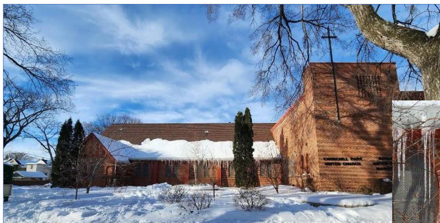
Icicles at Churchill Park United Church.

Much more on the Prairie to Pine website.