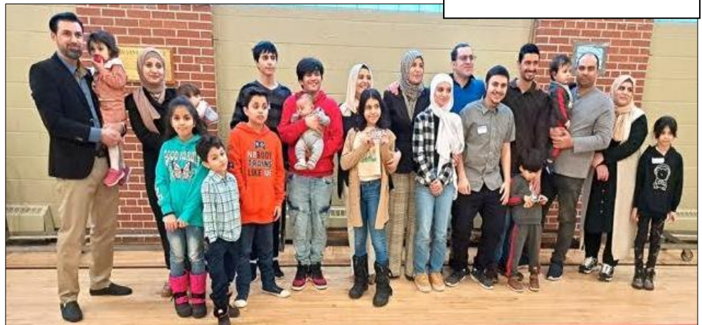
Honoured guests in CPUC gym at the Jan. 14th Anniversary Event.